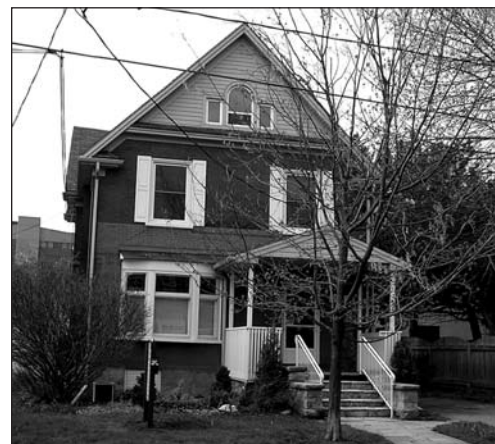
Our new home at 111 Duke Street

We're very excited about our new home at 111 Duke Street, made possible with the support of Kitchener-Conestoga Rotary. Since the new courthouse won't be completed for another year, and because that funding doesn't reach us until the dream home lottery ends in December, we will stay on Lancaster Street, and rent out space at our Duke Street home, delaying renovations