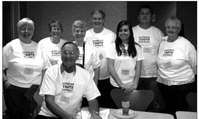
Some of the many volunteers who assist us during the symposium.

A distinguished line-up of twelve speakers from Canada and the U.S. challenged, educated, and motivated students at a critical time in their life, to make the right choices, stand up and make a difference, and to be leaders.